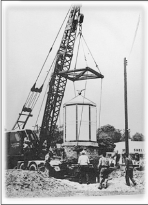
Honor Roll moving in 1963 (Rochester Hills Public Library)