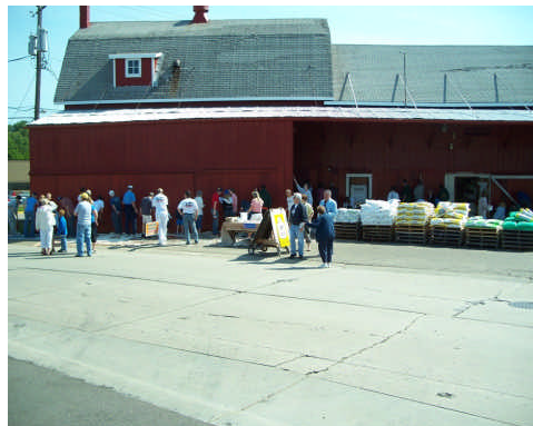
Shoulder to shoulder on the job