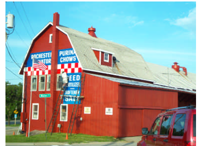
A whole new building!