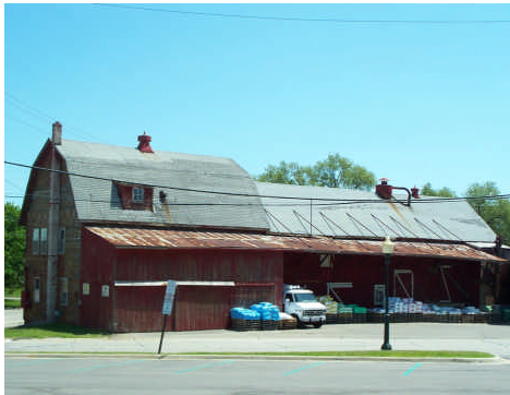
Before: the awning looks really sad.

Saturday, June 6 was bright and sunny. Community and Society members came to the Elevator painting full of enthusiasm and curiosity. A wonderful time was had by all and the painting has been finished. The entire building was cleaned, primed and painted except for the area from the ground up to a 10 foot line, by our partners CertaPro Painters. Our volunteer painters finished the job and Articulate Signs have finished the logo on the North-ish side of the building. The President's article on Page 3 gives more details.