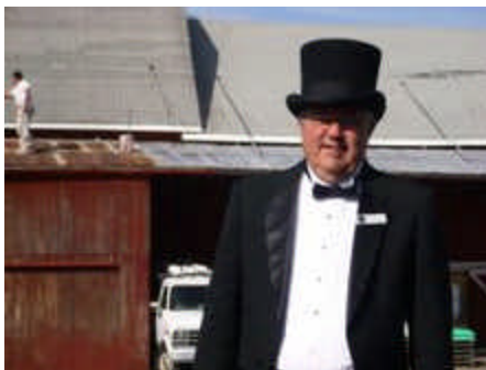
The well dressed painting CEO!